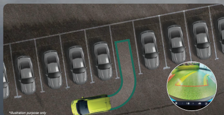
REAR CAMERA With 3 Parking Sensors