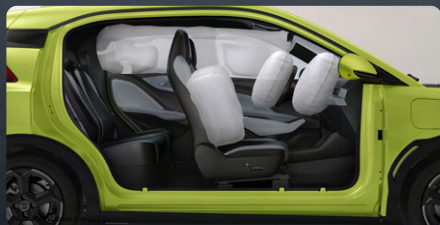
Comprehensive Airbag Protection (Dynamic)