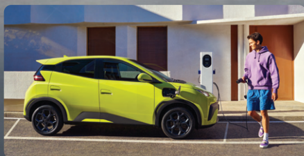
FAST CHARGING 30kW (Comfort) 40kW (Dynamic)